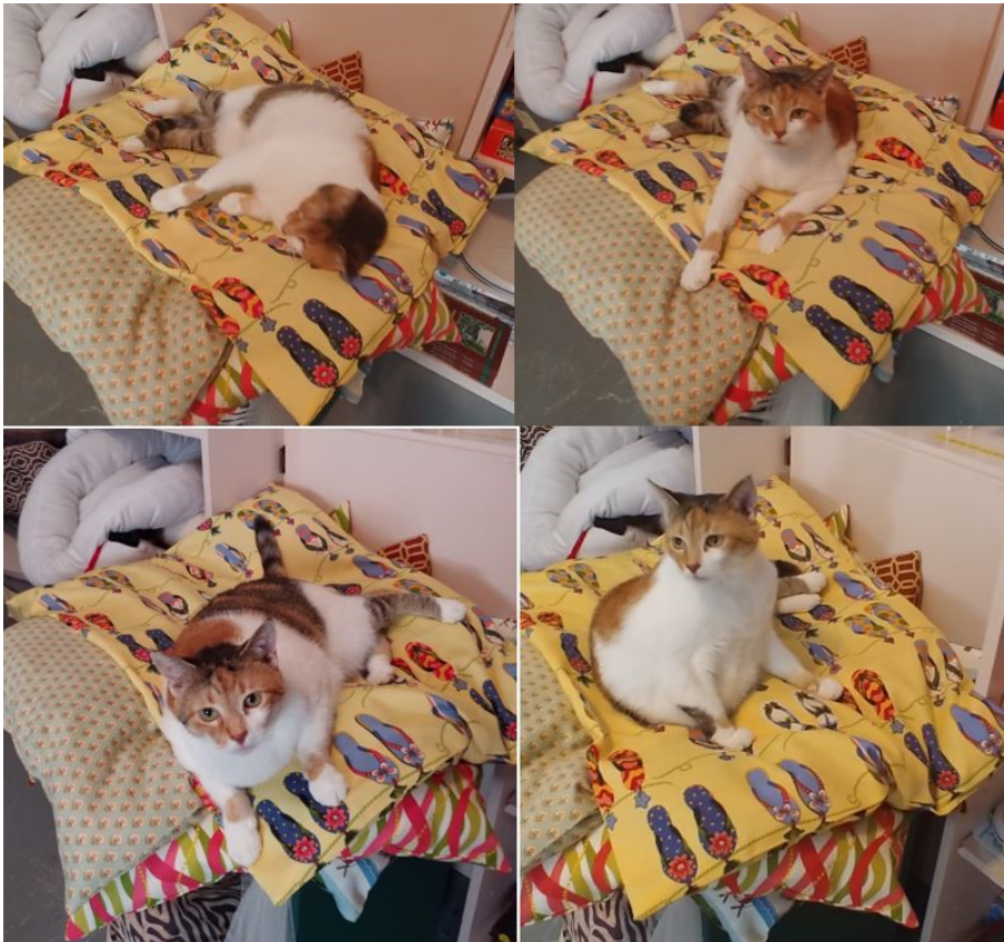
This is Dixie. She obviously loves the Cat Beds! She's also available for adoption.

If you have fabric to donate please drop off at the gift shop on Saturday from 12-4 or Monday, Wednesday or Friday from 11-4 at the surgical center. 10397 N Hwy 27 Ocala, FL 34482.