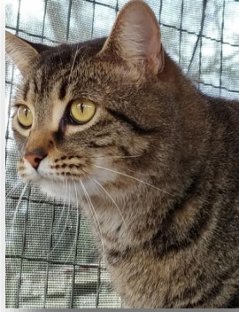
I'm Mickey Mouth!