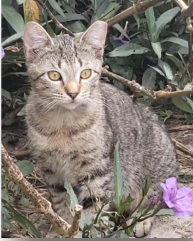
Hi! I'm Sage...